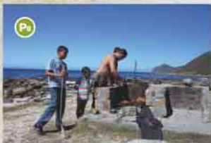
Buffels Bay: In the Cape of Good Hope, right on the beach with stunning views of False Bay, this is a great place to spend a relaxing day enjoying nature.