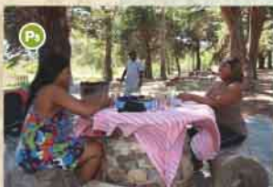
Perdekloof (Red hill): Bordering on the Cape of Good Hope this site offers the cool shade of large trees. Tel: 021 780 9100