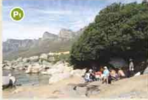
Oudekraal: A coastal delight that offers some shelter from the wind and a beautifully calm inlet to swim and splash in. Tel: 021 438 9555

There are few things that beat having a hearty meal in the midst of nature and the TMNP has a variety of braai and picnic spots that are great places for family and friends to gather. Many of our sites offer function and corporate facilities.