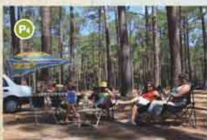
Tokai Plantation: Very popular with Capetonians, you can picnic and braai in the shade of tall pine trees. Tel: 021 712 7471