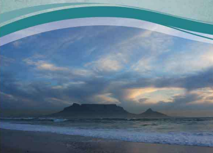
TABLE MOUNTAIN NATIONAL PARK

A Park for All, Forever n Park vir Almal, vir Altyd iPaka yoluntu lonke ngonaphakade